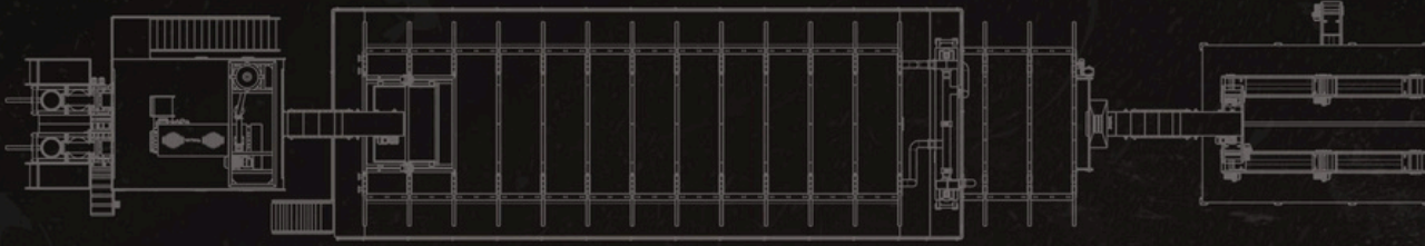
SHORT CUT Top View 1:100